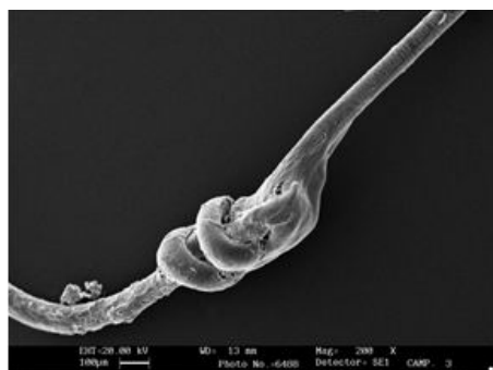
Figure 5: Fiber removal without residues.

During the last 20 years, the improvement of the implant technique, deep studies concerning more suitable materials for implantation and a huge number of medical and scientific reports have clearly shown that good results can only be achieved in a qualified medical setting.